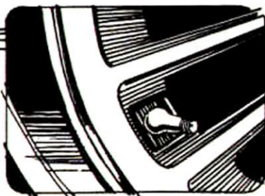
Tire Inflation Valve