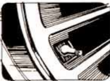
Tire Inflation Valve